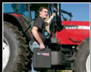
One tool set is all you need