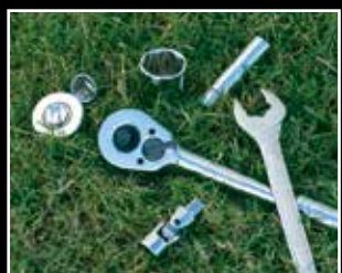
Spare parts available