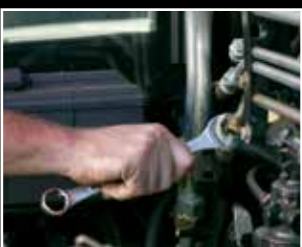
Each tool fits metric and inch