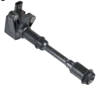
TIC379 Ignition Coil

Application: Ford Kuga TF 1.6L, 2013-2015