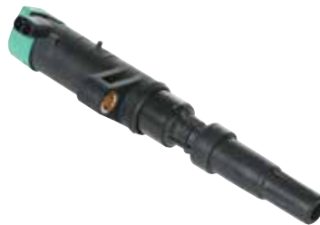
TIC3420E Ignition Coil

Application: Renault Clio 1.4L, 2.0L 2001-2008 and many more