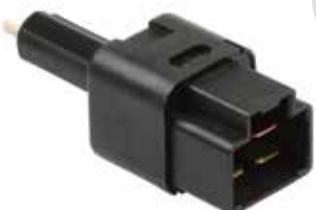
TBS158 Brake Light Switch

Application: Subaru Forester, Impreza, XV, 2.0L & 2.5L, 2008-2016