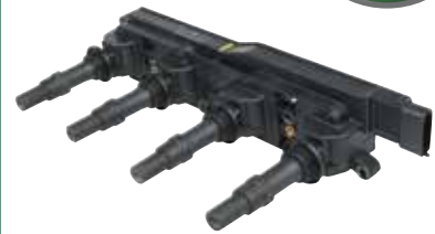
TIC0860E Ignition Coil

Application: Holden Astra, Barina, 1.8L, 1998-2007