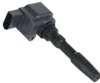
TIC382 Ignition Coil

Application: Audi RS7, S6, S7, 4.0L, V8 2012-Current