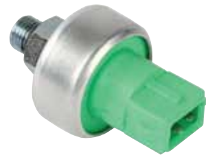
TPS164 Power Steering Switch

Application: Ford Falcon BA-BF, 4.0L-5.4L, 2002 - 2008