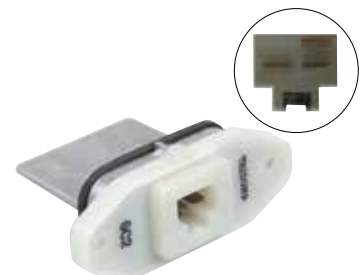
TFR242 Heater Fan Resistor

Application: Nissan X-Trail T30, 2.5L & Maxima 3.0L, Climate Control Models