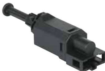
TBS156 Brake Light Switch

Application: VW Golf IV, 1.6L, 1998-2002