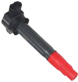
TIC377 Ignition Coil

Application: Mitsubishi Triton ML, MN 2.4L 2007-2013