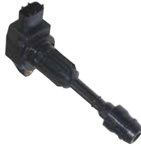
TIC378 Ignition Coil

Application: Nissan Micra K12, 2004-2010