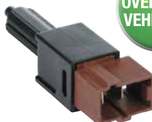
TBS157 Clutch Switch

Application: Nissan Navara, X-Trail and other popular models