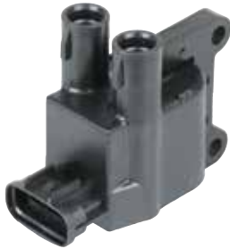
TIC380 Ignition Coil

Application: Toyota Landcruiser, 4.5L, 1998-2007