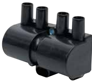
TIC2580E Ignition Coil

Application: Holden Rodeo, 2.2L, 2.4L, 1998-2008